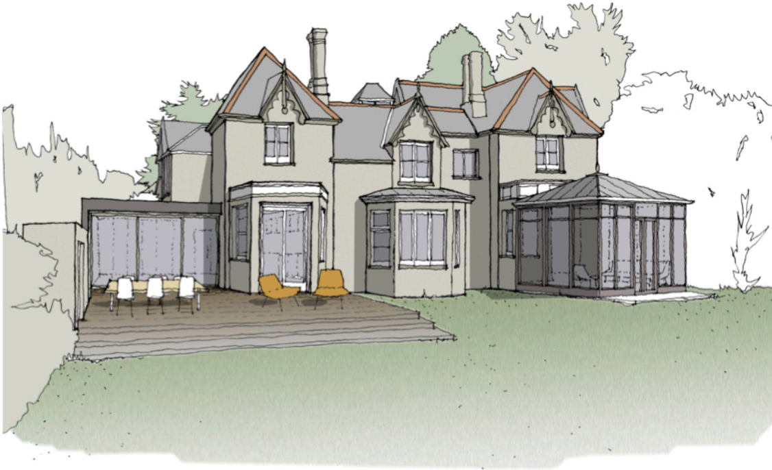
Potential perspective from garden showing new family kitchen wing, two storey gable and enlarged conservatory.